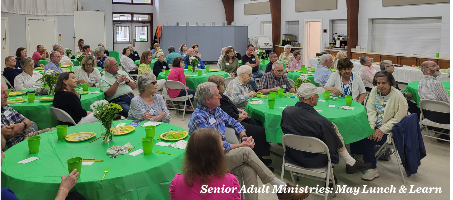
Senior Adult Ministries: May Lunch & Learn