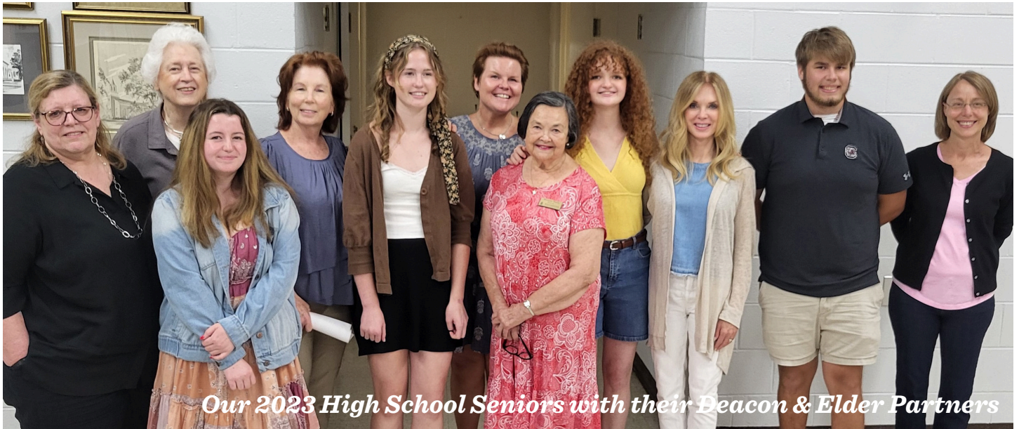
Our 2023 High School Seniors with their Deacon & Elder Partners