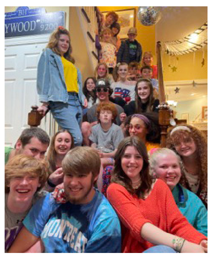
Youth Group Oscar's Party