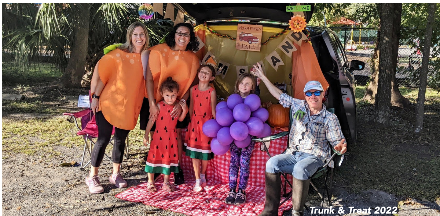
Trunk & Treat 2022