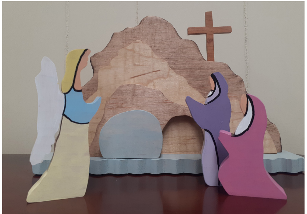
Resurrection Scene created by WPC member Gary Flowers