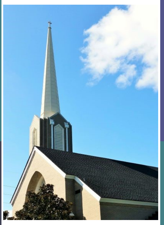
Creating an option for Christian burials at our church home.